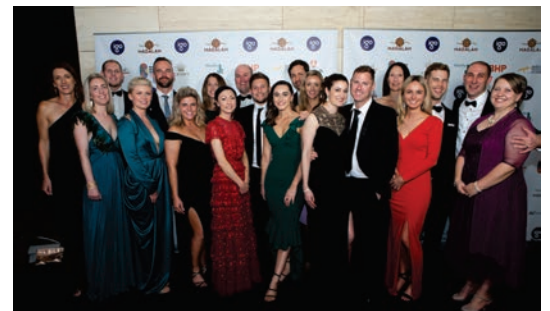
IGO Employees at the Madalah Ball 2019

This year the event helped raise funding for 38 additional scholarships.