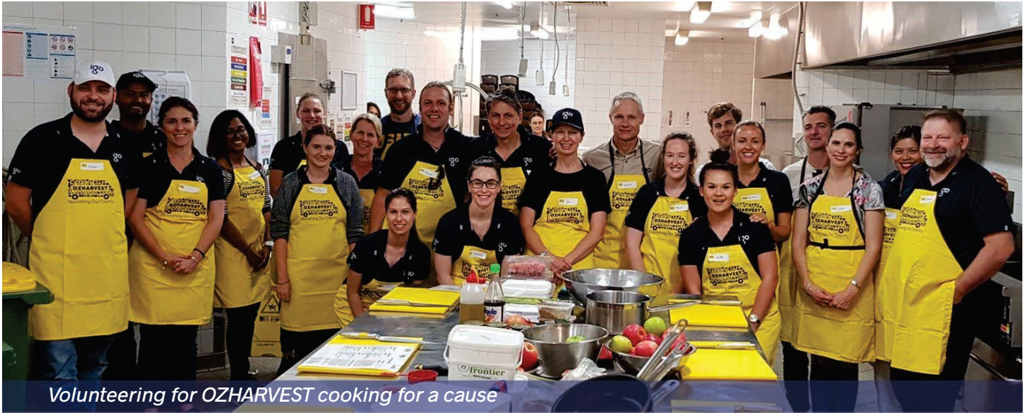
Volunteering for OZHARVEST cooking for a cause

At IGO, our employees are our greatest asset. Our purpose was developed by our people and launched approximately a year ago in October 2018. Everything we do, our culture, how we work with each other in the business, how we engage with our external stakeholders, our strategy to be a globally relevant supplier of metals critical to clean energy, starts with our Purpose.