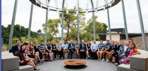
Dandjoo Darbalung Program Official Launch