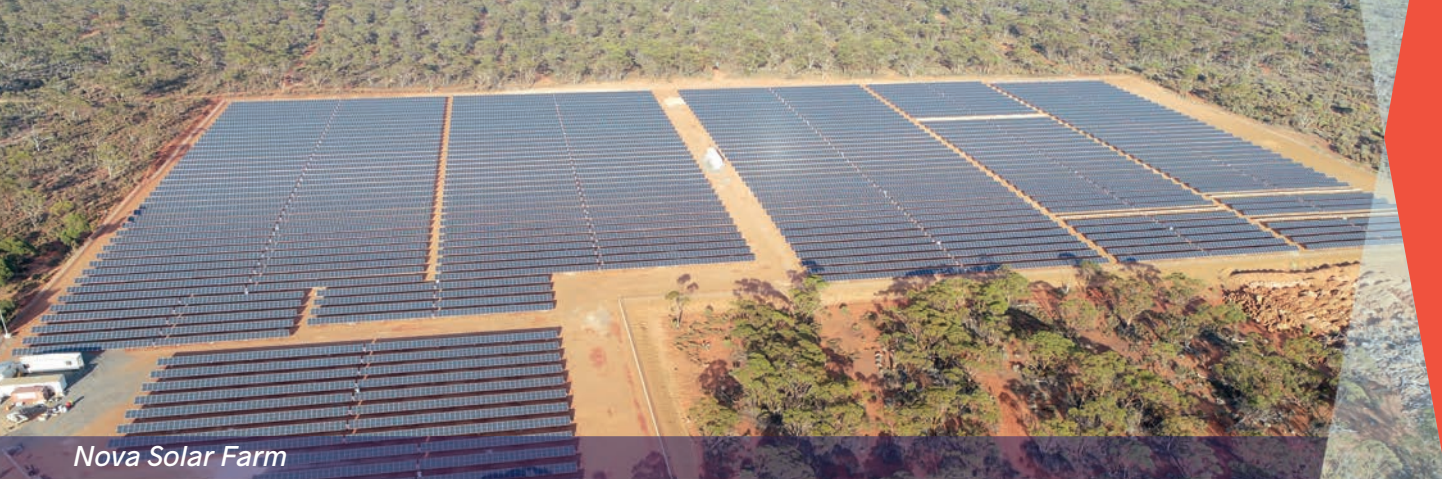
Nova Solar Farm